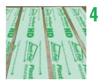
Install Nailers and Insulation Cut the first row of insulation to a 21-3/4" width. Cut subsequent rows to 22-1/2" widths. Use the insulation cut as guides to place successive rows of nailers at 24" on centres.

Your basement floor is now correctly insulated and ready for your final decorating touch. You should notice the finished floor is now much more comfortable.