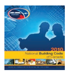
Follow the building code. Be sure to follow the building code requirements applicable in your region.